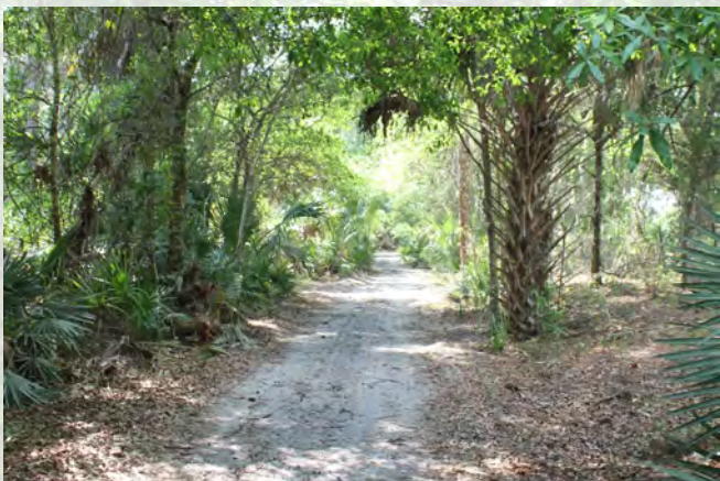
A section of the trail for the Fun Walk/Run. Natural Florida at its finest!

The Center has been on this property for many years but just recently acquired the remaining 300 acres. The 2nd Annual Get Wild Fun 4K Walk/Run is a way to invite our community to not only see the animals, but to encourage them to enjoy the beautiful, pristine nature trails at our facility. This one of a kind fun run attracts runners and walkers of all ages, from experienced cross country runners, to those looking to explore our trails at their leisure. We hope you will consider sponsoring this event. Our community supporters mean everything to us and the animals we serve!