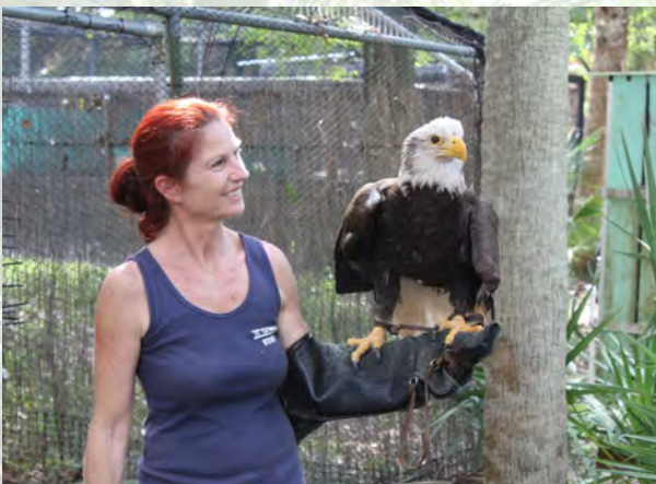
Gracie the Bald Eagle has been with the Center since 1999 after she fell 65 feet from her nest onto the ground. Gracie is a beloved Ambassador