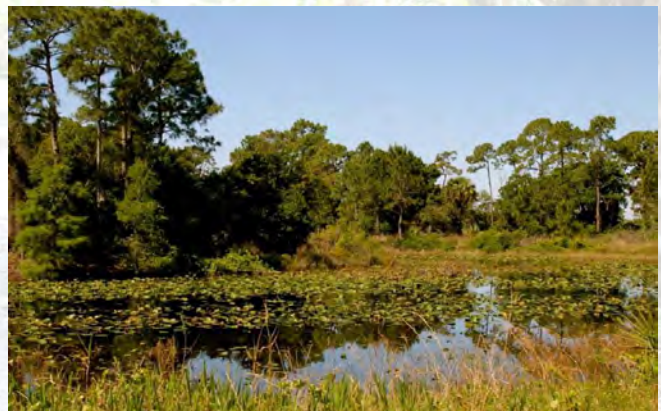
Ponds throughout the property make for a very unique scenery along the trail. Participants will travel along nature trails that they will never forget.